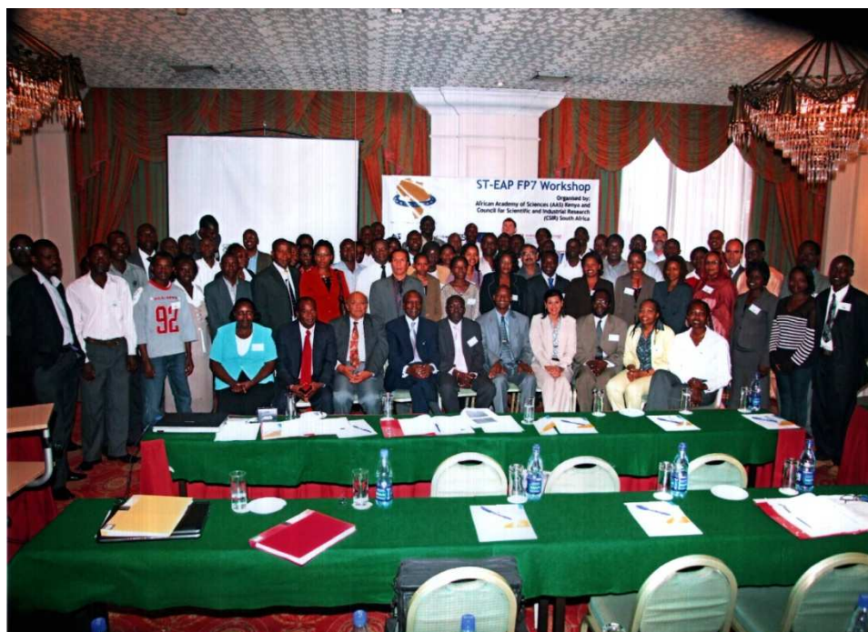
ST-EAP participants at the workshop in Nairobi, Kenya (26-27 March 2009)